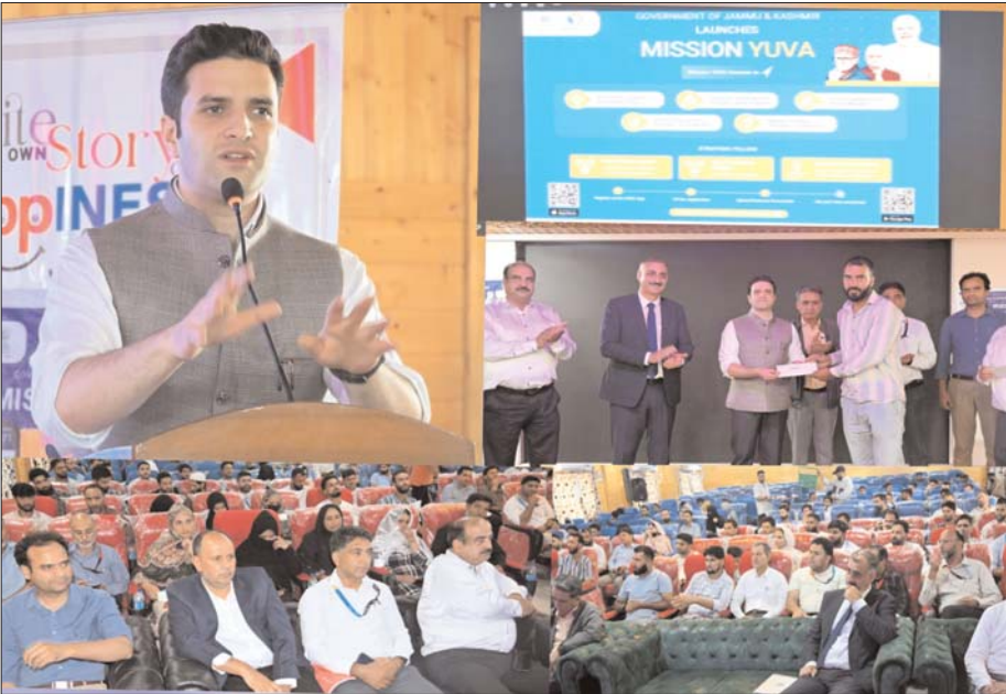
HIMALAYAN MAIL NEWS JAMMU, JULY 25

As part of the ongoing efforts to promote youth empowerment and entrepreneurship, 'Roz-e-YUVA' program under Mission YUVA initiative of the government was today held at the Conference Hall of Mini-secretariat Kulgam. The event organised by the District Employment Of-